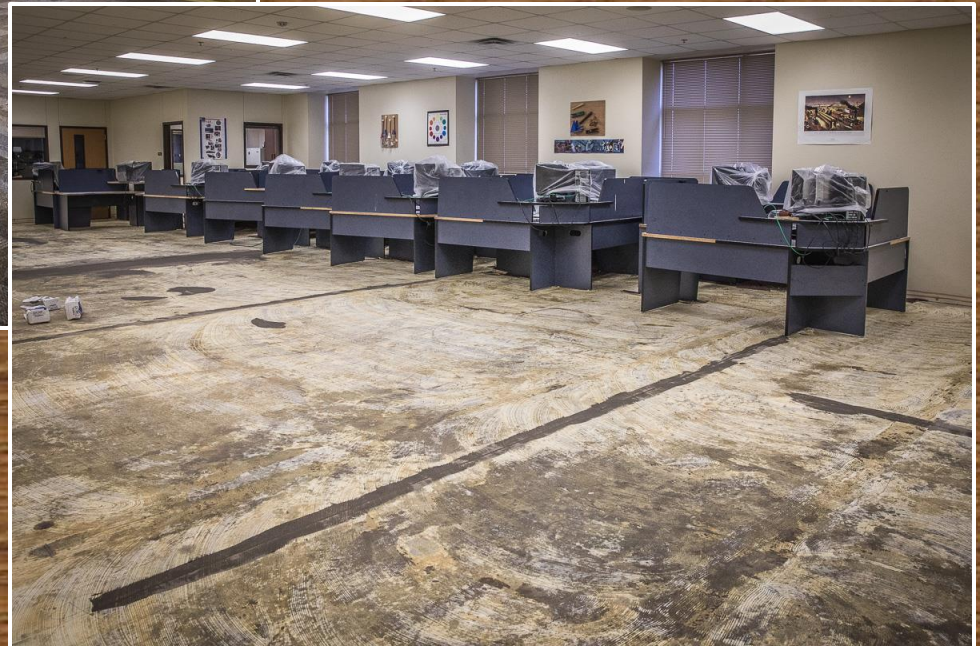
Prairie Vista MS